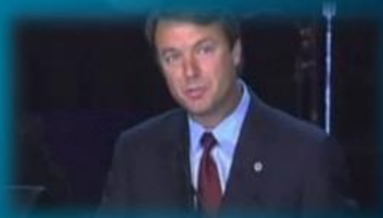
Senator John Edwards September 11, 2004

"The bricks have fallen, but we will build with dressed stones; the sycamores have been cut down, but we will put cedars in their place."